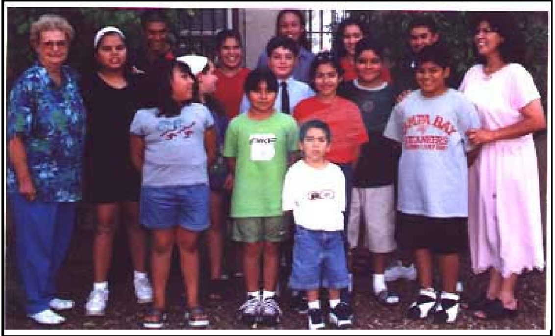
Parkway Terrace Youth Committee

Hi! We are from the Parkway Terrace Neighborhood Association Youth Committee.